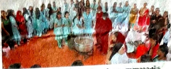
മാള കാർമൽ കോളജ് സന്ധ്യശാന്ത്ര വിഭാഗം അന്താരാഷ്ട്ര പയർവർഗ്ഗ വർഷാചരണത്തിന്റെ ഭാഗമായി സംഘടിപ്പിച്ച 'കർക്കടകത്തിലെ ആരോഗ്യം' പരിപാടിയുടെ ഭാഗമായി കർക്കടക കഞ്ഞി പാചകം ചെയ്യുന്നു.

മാള • കർക്കടക മാസത്തിൽ കർക്കടക കഞ്ഞിയുടെ രുചിയനിഞ്ഞ് പാചകം ചെയ്തും കാർമൽ കോളജ് വിദ്യാർഥിനികൾ 'കർക്കടകത്തിലെ ആരോഗ്യം' പരിപാടി വ്യത്യസ്തമാക്കി.