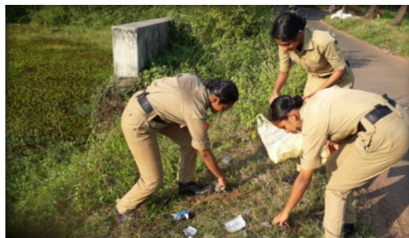
Carmel girls send the message of freedom from plastic pollution even to the outside world through several cleaning campaigns over the year.