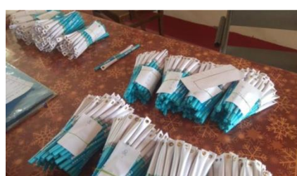
Paper Pen, Files, Cloth Bags