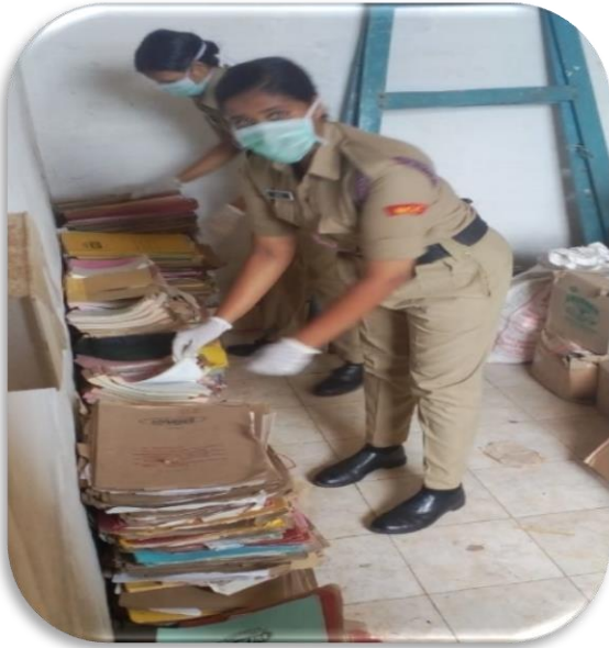
NCC organized cleaning activities, post flood, at Annamanada Panchayath