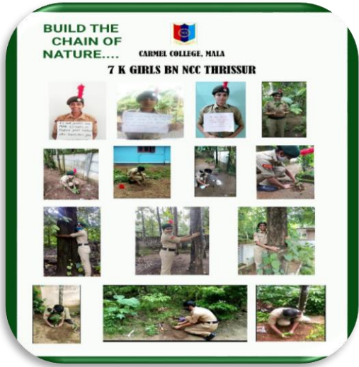
NCC cadets planted tree saplings and created a video 'Build the Chain of Nature' sharing the message on the importance of protecting nature (2020)