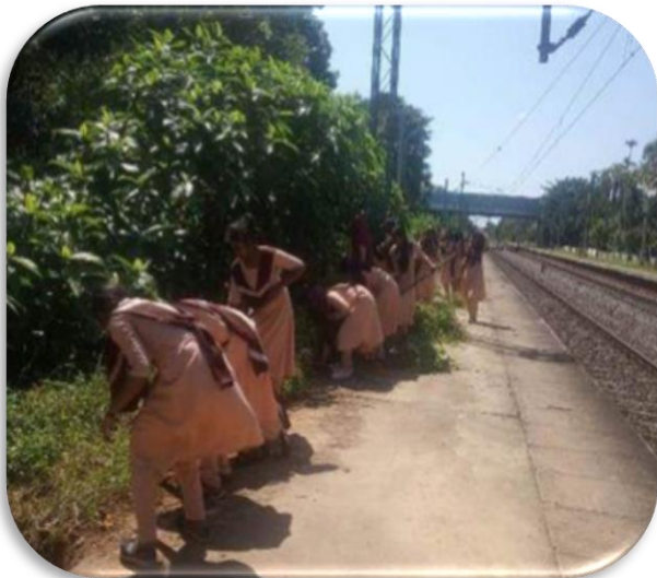
NSS volunteers conducted a cleaning programme at Divine Nagar Railway Station