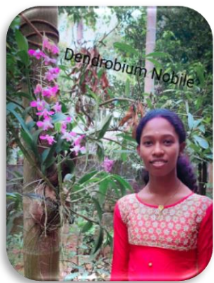
Lock down activity: Cultivation of Orchid and anthurium in homes by members of Orchid and Anthurium Club (2020)