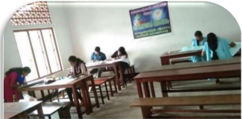
Intercollegiate Poster making competition