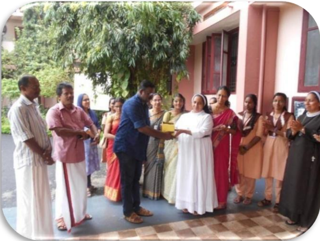
NSS organized distribution of saplings of jackfruit tree to PTA members and student volunteers to plant in their own house