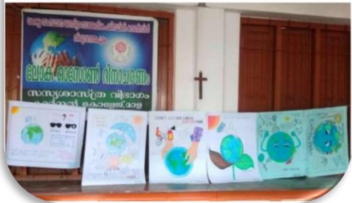
Inter-collegiate Poster making competition on “Ozone and Human Beings” by the Research Department of Botany as part of World Ozone Day