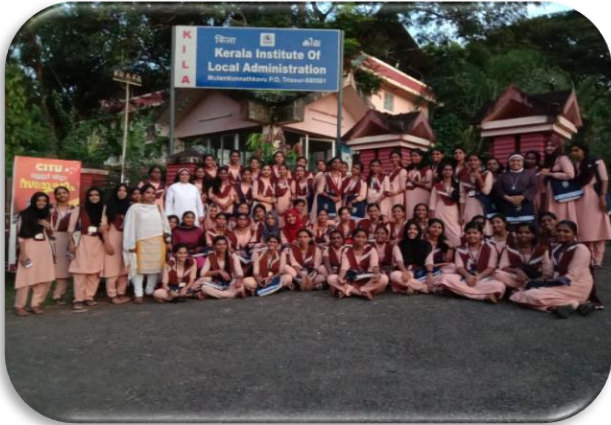
Cleaning initiative around KILA by the students of Sociology