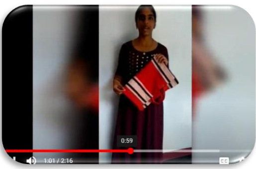
Video on Green Protocol by NSS for public awareness (2020)