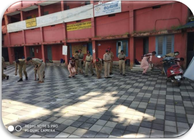
Cleaning initiative by NCC and NSS units