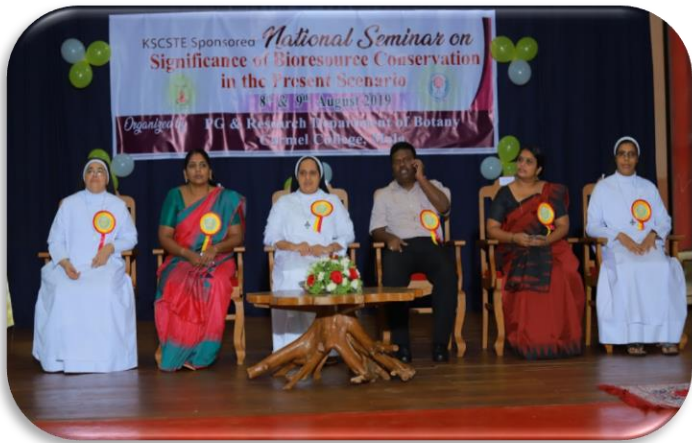
KSCSTE sponsored two-day national seminar on “Significance of Bio Resource Conservation in the Present Scenario” – Research Department of Botany (8-9 Aug 2019)