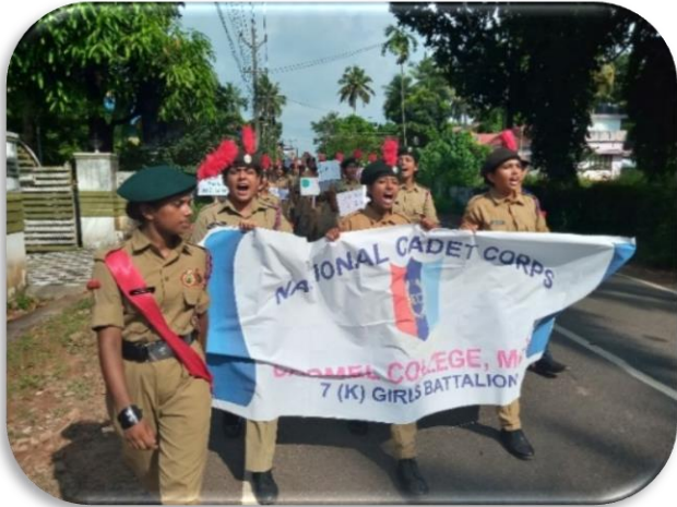
NCC organized a rally and performed a street play at the private bus stand, Mala, to raise public awareness about water conservation